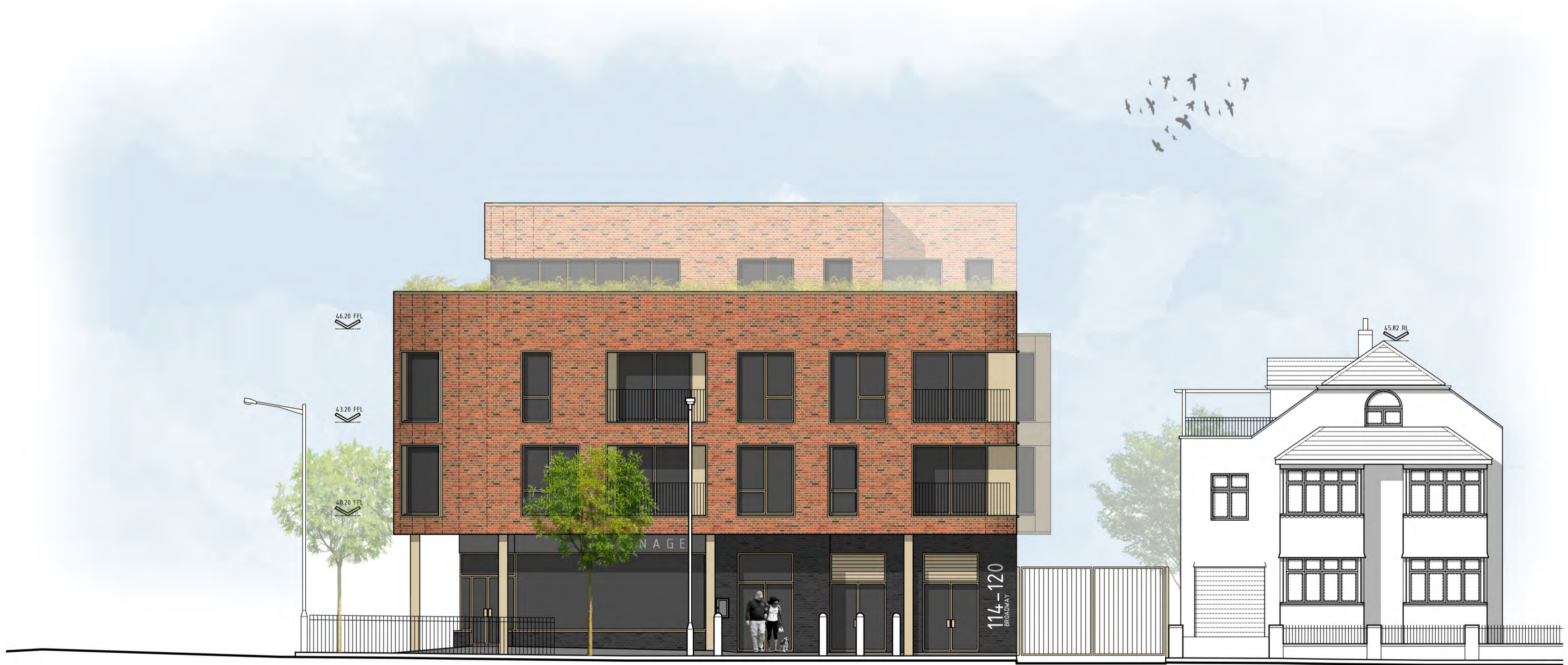
AS PROPOSED: STREET-SCENE AA, along Broadway.